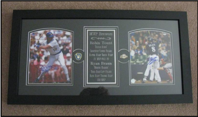
Doubled framed print size 17"x32" containing two autographed prints of Milwaukee Brewers MVP players. Robin Yount #19 2X MVP 1982 and 1989 Ryan Braun #8 2011 MVP Value $500.00 plus Starting bid $200.00